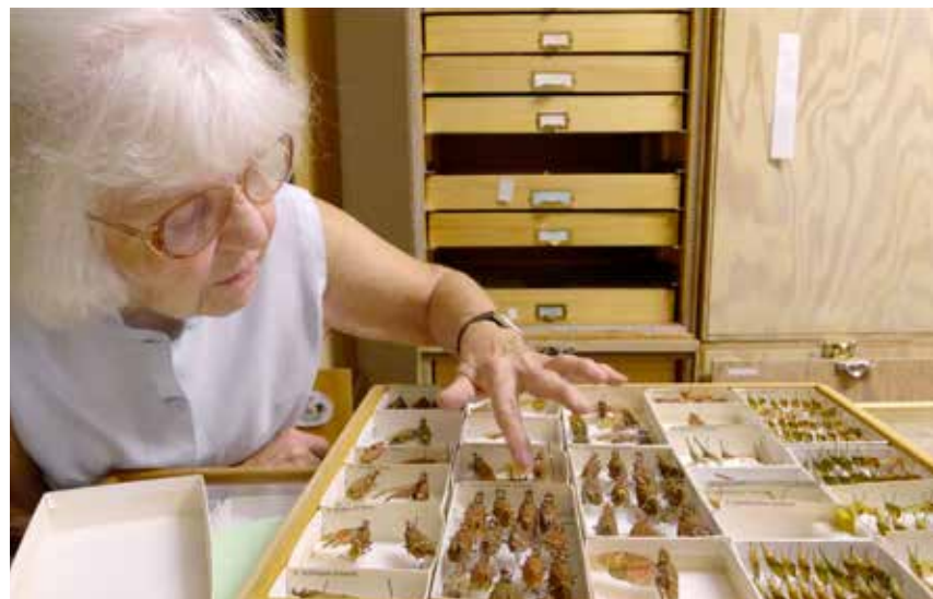
THE LOVE BUGS | SUN, MARCH 15 | 4:00 PM

Patrons without reservations will be asked to join the STANDBY line. Once the Reserved line has entered the theater, remaining seats will be awarded to patrons in the Standby line on a space-available basis.