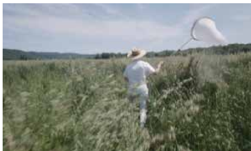
FARMSCAPE ECOLOGY | SAT, MARCH 21 | 1:30 PM